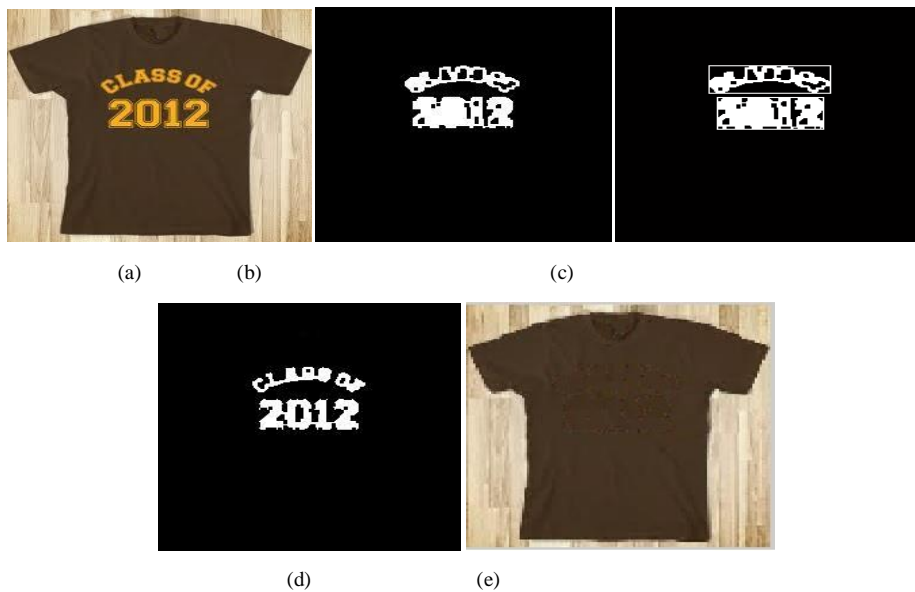
Fig. 4 Text Detection and Inpainting (a) Original image (b) Image after applying first set of criteria (c) Image after applying second set of criteria (d) Image mask (e) Inpainted image using patch size 5 x 5 and search window size 81 x 81

To eliminate small objects, connected component labelling is applied to the resultant image. (c) represents text detection by applying second set of criteria which eliminates all the objects whose area is less than 300 and filled area is less than 500.